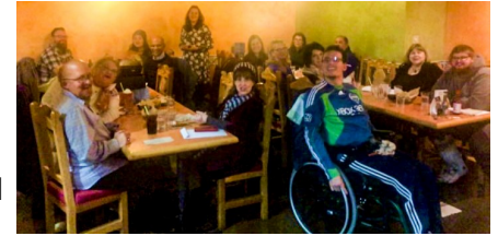
LDP graduate celebration

The LDP is a one-year project in collaboration with and funded by the Washington State Developmental Disabilities Council ( www.ddc.wa.gov ). A team was created to facilitate a hybrid leadership development program. Online courses were created using a Learning Management System (LMS). Users could log on to the LMS and access the material during their free time and complete the coursework at their own pace. A monthly call time was scheduled for participants to call in with questions and an online discussion board was also available to promote online conversations amongst participants. An alternative hybrid option available included a semi-monthly packet of materials mailed to participants.