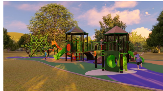
Seaview Park in Edmonds